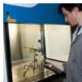
AIR FLOW SPEED TEST

Each Faster cabinet is tested conforming to EN - 12469:2000, EN - 61010:2001 and released with FAT certificate of the tests performed.