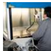
NOISE LEVEL TEST