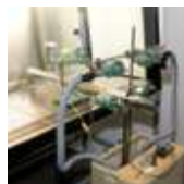
KI DISCUSS TEST